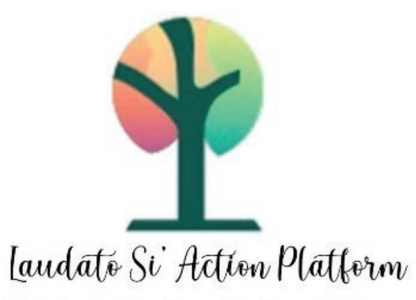
US Adorers Study and Reflection Process

When asked about the Laudato Si' study and reflection process being carried out in the US Region, the phrase most often given is 'more aware'...I am/we are experiencing a movement of 'more aware.' A 'more aware' that is causing a gentle rumbling of conversion in our minds and hearts. A 'more aware' that is affecting changes in our choices and decisions, individually and communally. A 'more aware' that is pushing us to action, big and small. A 'more aware' that is allowing us to wait and be in patient in our listening for what call and direction is to emerge.