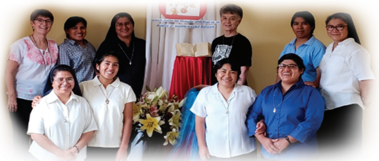
Region of the USA