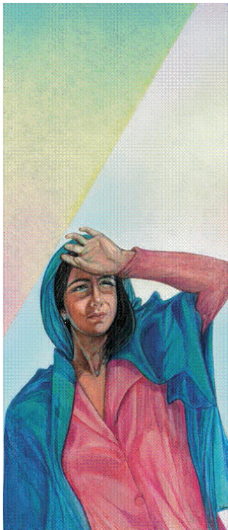
Opera di Carmela Boccasile

The first session of the IV assembly of the Italian Region was held at the generalate of the Passionist Fathers in Rome on November 1-2, 2019. The elected delegates participated, but with the intention of beginning a process involving as much as possible the nearly four hundred Sisters giving life to the ASC Region.